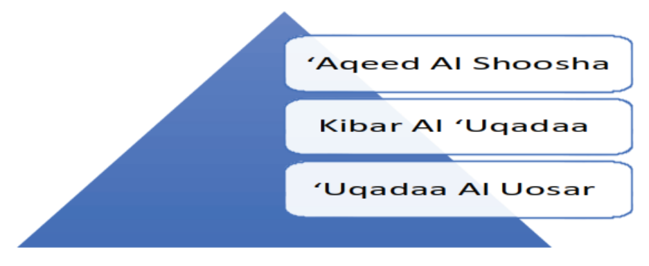
Figure 4. Structure of Al 'Aqada Institution within Tribe The figure was created by the author

ers there are Al 'Aqada, who are community-based lieutenants representing the military apparatus of a tribe. They are the ones who declare or stop war in ideal circumstances. Their institution is set up in pyramid-like structure as shown in figure (4):