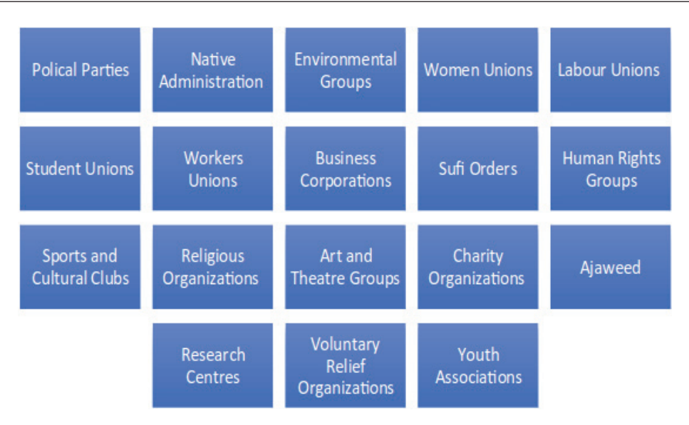
Figure 1. Civil society according to Ministry of Social Affairs in South Darfur The figure was created by the author

The following section of the paper examines community-based interventions and local mechanisms of conflict resolution that have been existing in the Darfur context.